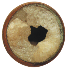
Cross section of a scaled hot water pipe